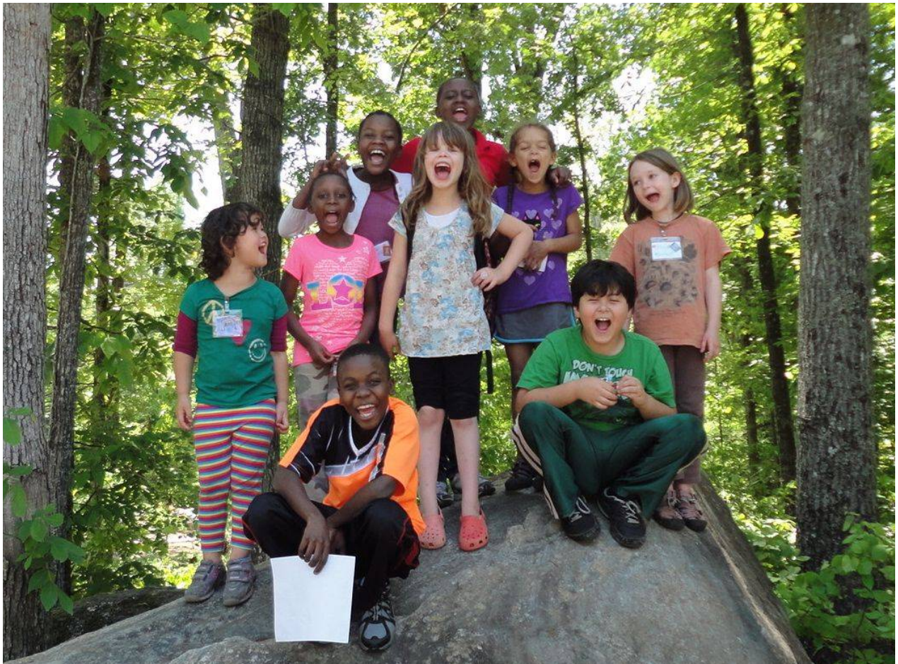
Young Friends at the 2012 Gathered Meeting Retreat: Sounding the Divine or shouting "Ice Cream"?